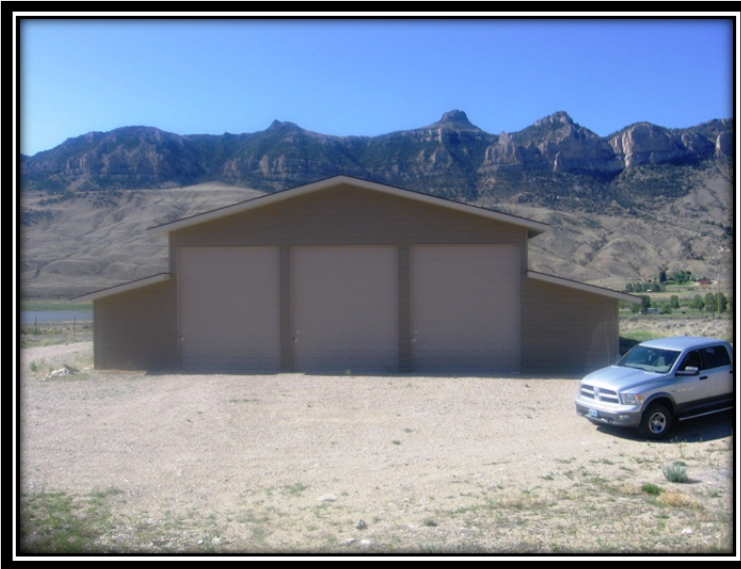
Commercial Storage Building