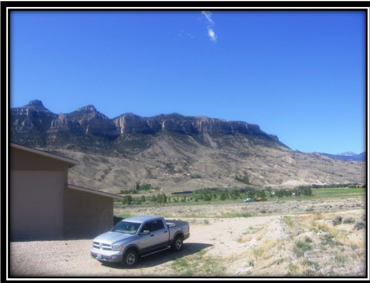
Buffalo Bill Reservoir